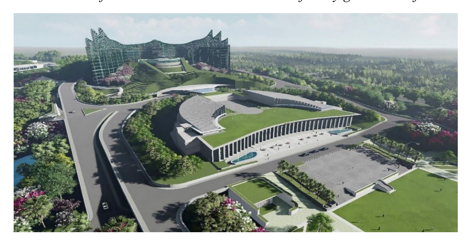
Exterior view of the Presidential Palace and the Presidential Office in Indonesia's new capital Nusantara (image)

Orders received for 33 elevators and 22 escalators for key government facilities